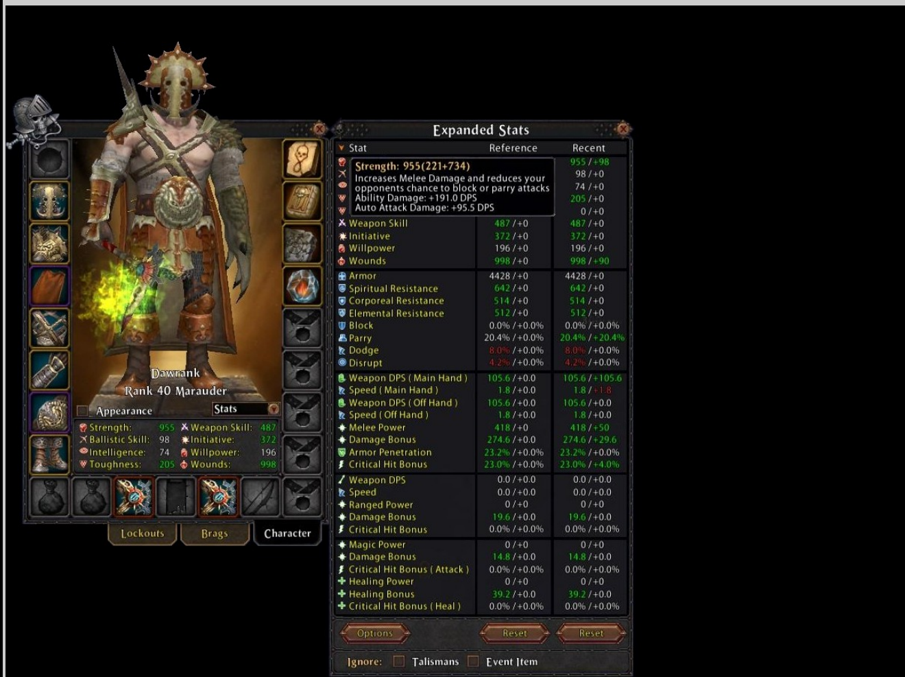
CaVES Stat Mouseover Tooltip Displayed on the right of the Stat Icon

E) Show Tooltips on Stat Icon Mouse Over Only – If this option is checked or enabled, then the stat line mouse over area that causes the display of a tooltip is limited to just the stat icon. The tooltip will appear immediately to the right of the cursor.